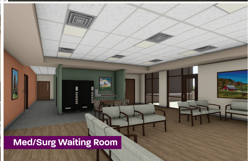
Med/Surg Waiting Room