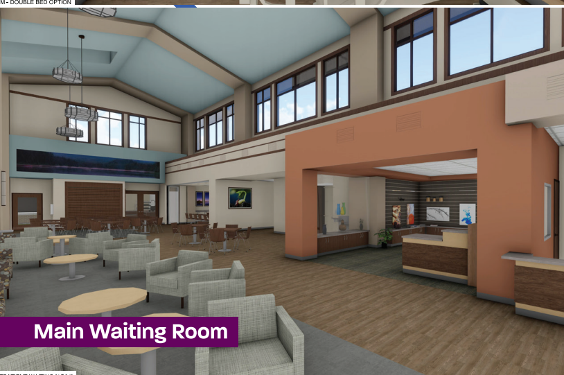
Main Waiting Room